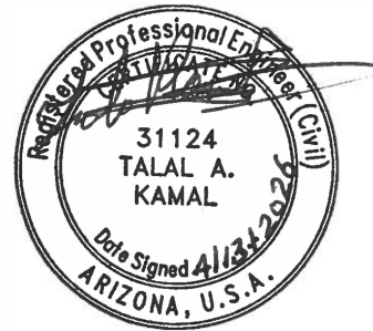
Arizona Department of Transportation Traffic Engineering Design Group