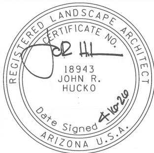
Arizona Department of Transportation Roadside Development Section